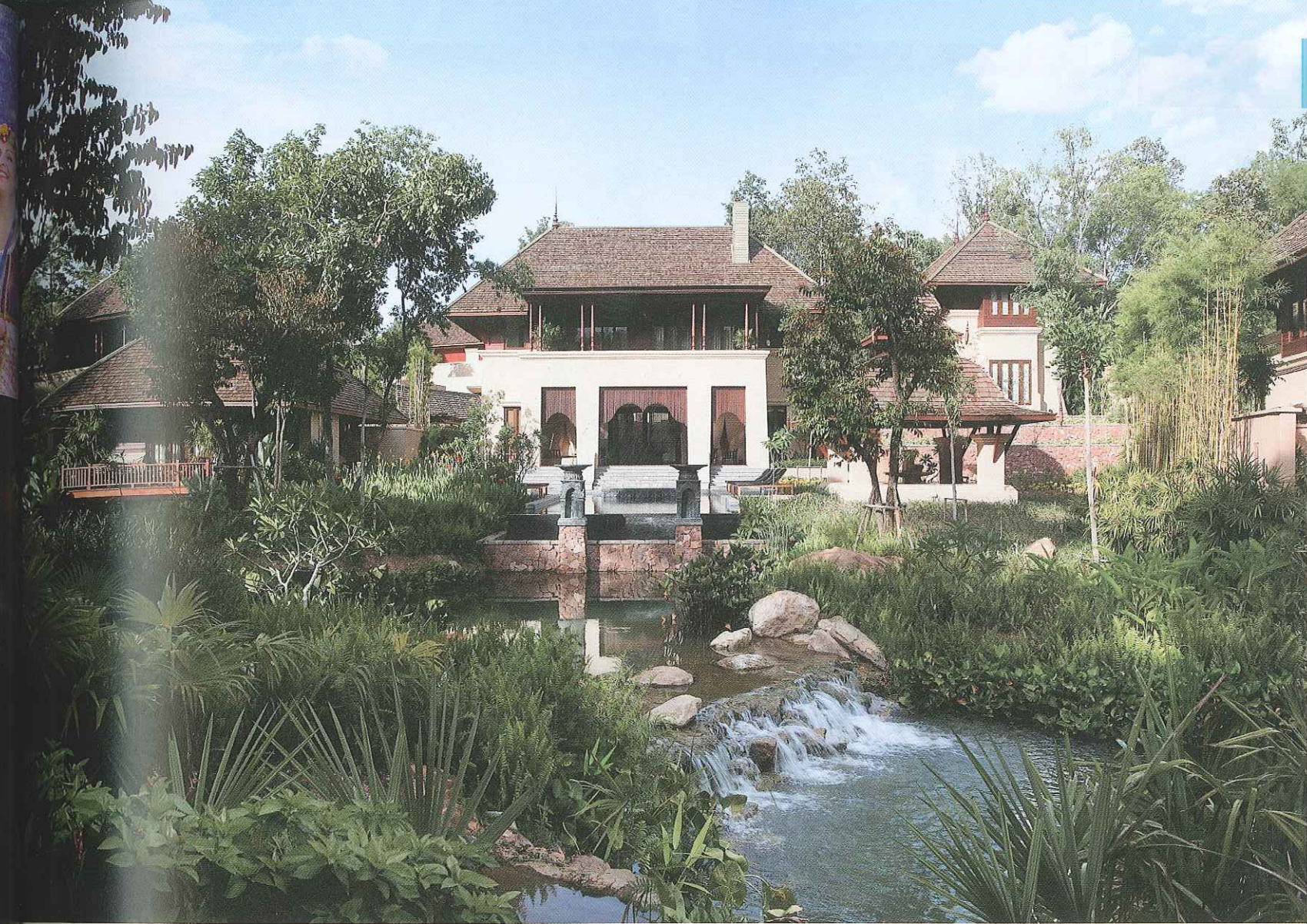
Actual photo taken at Residences at Four Seasons Resort Chiang Mai