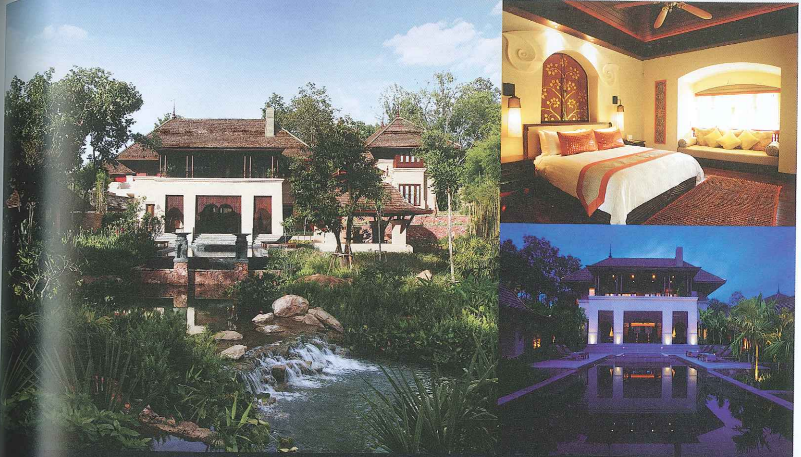
From Top Left The actual Residence surrounded by Bill Benley's landscape design; Villa bedroom shot in the Residence compound; the actual exterior shot of the Residences and private pool area

Looking for a hideaway where you can bask in the solitude and stunning views? This fabulous four-bedroom villa in AO PO fits the bill perfectly. The colonial style building has beautifully crafted teak floors, doors, windows and vaulted beams and is on a hill overlooking Phang Nga Bay. The 30,461sqft villa features two inner courtyards that facilitate airflow and let in natural light. Special facilities include a poolroom, fully-equipped gym, spacious car park, lush gardens, staff quarters and a swimming pool. This delightful property is on the market for US$3M through Sotheby's International.